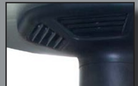
SIX SETS OF LOUVERS